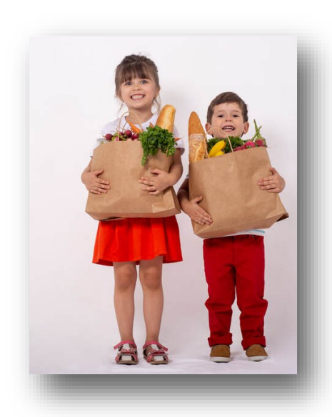
Prayer Say this prayer together at meal times this week.

During the COVID-19 lockdown, we have seen many people sharing what they have. Recently we have seen stories of people making masks and sending them to vulnerable people. Other people have shared their food or done shopping for neighbours who have not been able to go out.